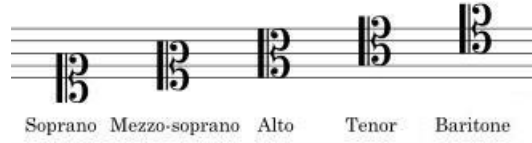
Moveable C Clefs

The alto clef is used for viola; the remaining moveable C clefs are not used, except the tenor clef is used extensively in cello, bassoon, trombone, (and euphonium) in études, solos, orchestral, and chamber music. Advanced tuba and string bass players need to know how to read it when using études and solos for other instruments. Trombone players also need to know how to read alto clef.