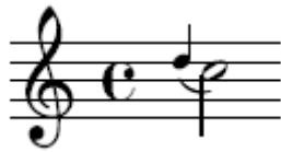
Appoggiatura ("to lean")