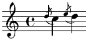
Acciaccatura ("to crush")