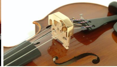
Heavy Practice Mute