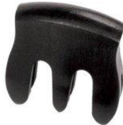
Ebony Violin Mute

Click on photograph to purchase on Amazon