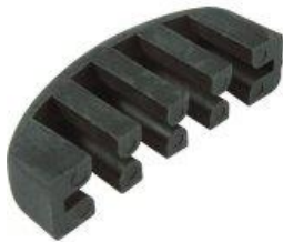
Gliesel Practice Mute